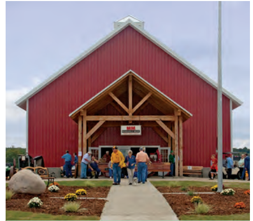
Antique Tractor Association's new barn. GIFT awarded a grant to ATA to help fund the project.

Junior Achievement was a recent recipient of a grant from GIFT. JA is a partnership between the business community, educators and volunteers - all working together to inspire young people to dream big and reach their full potential. JA's hands-on, experiential programs teach the key concepts of work readiness, entrepreneurship and financial literacy to young people in the community. The grant from GIFT helps to support JA's current programs.