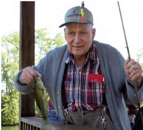
The picture of this Hillcrest Home resident was taken at Giant Goose in Atkinson. A grant from the GIFT Foundation helped to purchase a handicapped accessible bus for the Home, making trips like this possible.