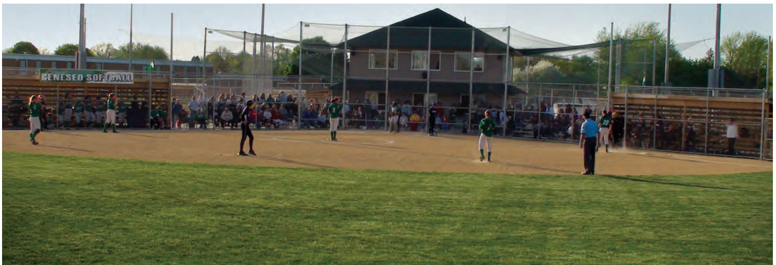
Fans enjoy watching a Geneseo High School softball game at the newly constructed J.F. Edwards Softball / Baseball complex. GIFT was proud to award a grant to this community project that was completed with 100% volunteer labor and funded entirely by the community.