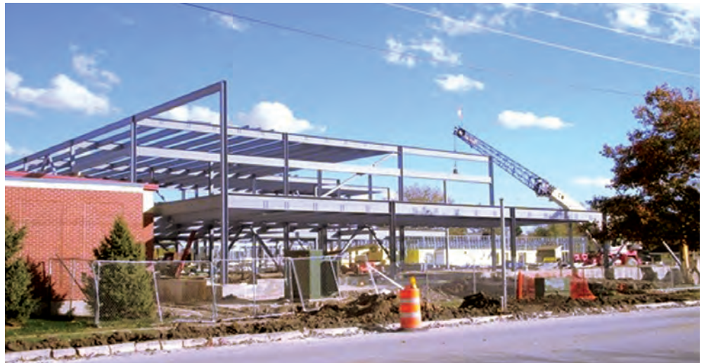
Hammond Henry Hospital Foundation received a grant from the GIFT Foundation toward the "Designed To Be Patient Kind" building project.